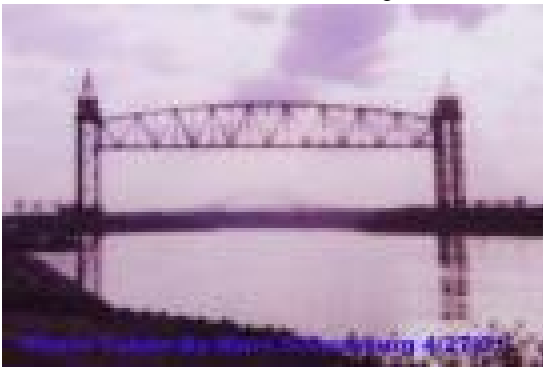
Bourne Vertical Lift Railroad Bridge