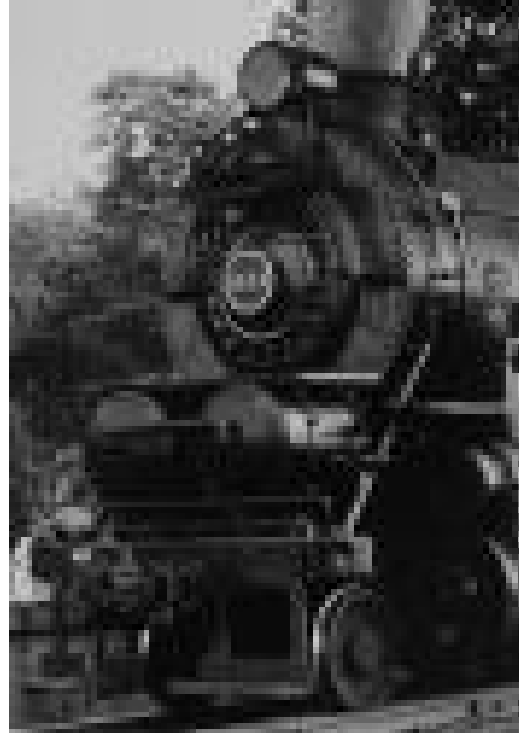
The Face of Steam.