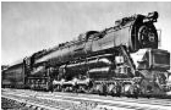
Pennsylvania RR S-2 Steam Turbine