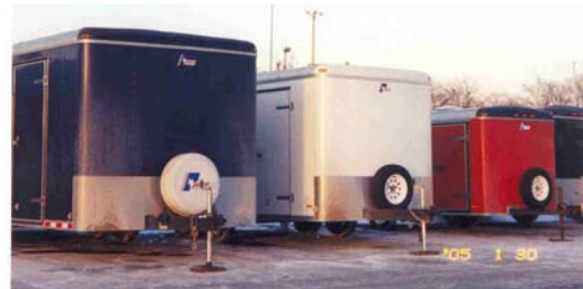
Springfield 2005, not in patriotic order!

The Secretary c/o M-P Model RR Club 23 Hyde Park Drive Gales Ferry, CT 06335-1941.