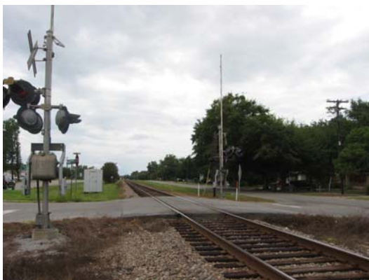
RR crossing somewhere in South Carolina