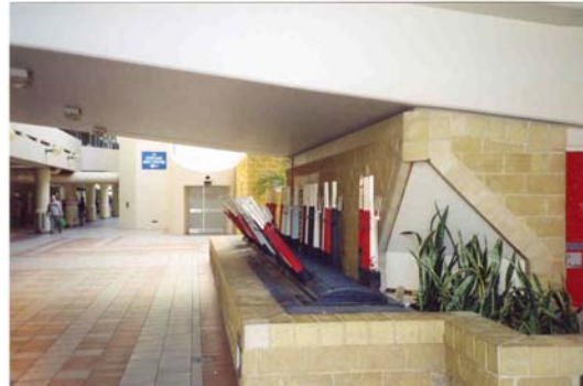
A preserved lever frame in the concourse at Perth Station.

natural gas 2 . When I was waiting curbside for a bus, the difference between that and diesel was most noticeable.