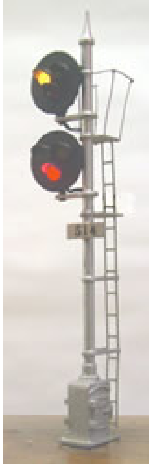
Sure looks real but it's a model