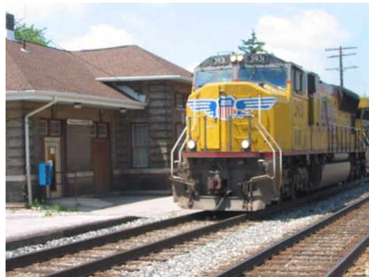
Union Pacific at Fostoria, Ohio