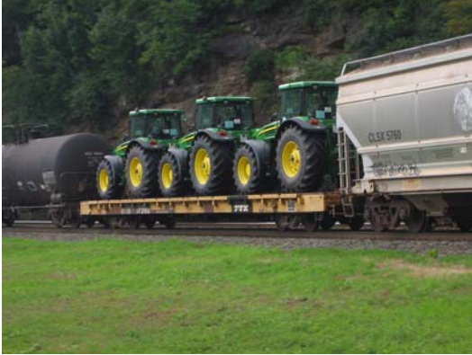
What a Load! (Horseshoe Curve, 2004)

November will be very busy! We need many people to come and help at Essex, Westerly and Willimantic!