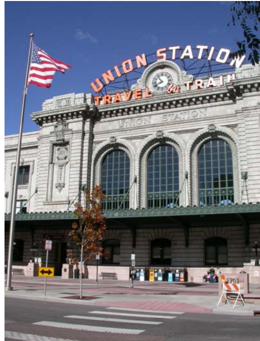
Union Station in Denver, Colorado

In addition to Caboose Hobbies, I made a stop at the Colorado Railroad Museum in Golden, Colorado. They have a number of pieces of equipment on display as well as an HO layout and library.