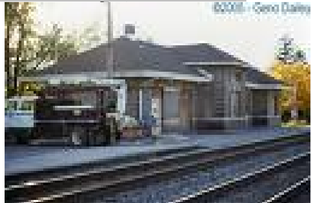
Amtrak Station Fostoria, Ohio